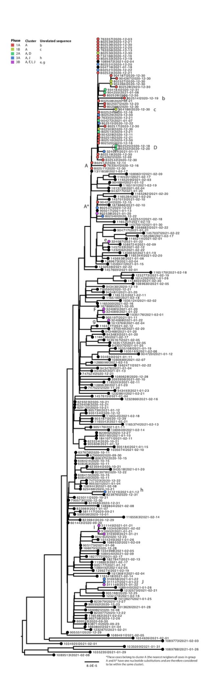
Fig 2. Maximum likelihood analysis of 60 Alpha variant SARS-CoV-2 whole genome sequences obtained from individuals living in the municipality Lansingerland, the Netherlands, or with an epidemiological link to School X or neighbouring schools and child care centres from December 30<sup>th</sup> 2020 to January 22<sup>nd</sup> 2021, in a background of 140 Alpha variant sequences obtained from the Netherlands from November 29<sup>th</sup> 2020 until February 22<sup>th</sup> 2021 and 20 Alpha variant sequences from the United Kingdom from September 21<sup>th</sup> until October 21<sup>th</sup> 2020 (black). Colours indicate the study phase in which specimens were collected. Scale bar represents the number of nucleotide substitutions per site. The text next to each sequence indicates the GISAID accession id and sample collection date.

https://doi.org/10.1371/journal.pone.0276696.g002